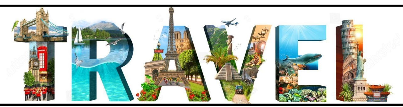
Potential 2026 Trips Tahoe (Heavenly, Kirkwood, Northstar) —> Epic Pass

Address: 2235 Oak Tree Dr NW. Dover Ohio 44622